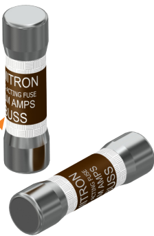
Designation on fuse